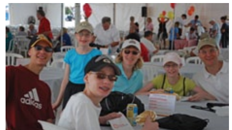
From left to right: Milwaukee Brewers Baseball, Family Camp Out, Timber Rattlers Baseball, Madison Mallards Baseball, Milwaukee County Zoo, Pawtucket Red Sox Baseball, Bay Beach Amusement Park, State Fair