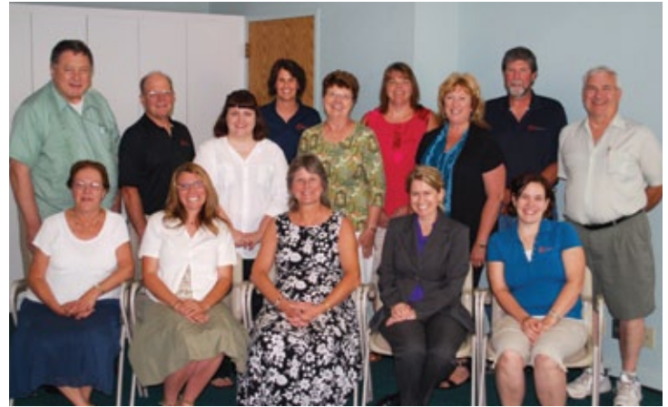
Members of FLAG at the July 21 Meeting.

The meeting ended with an update on our support for the Society of St. Vincent de Paul (SVdP) over the last three years of our national partnership. The three-year partnership with SVdP officially ends December 31, 2011. The Board of Directors will consider extending the partnership at its December Board meeting. As part of our evaluation process, FLAG completed a brief survey sharing their thoughts, ideas, and questions regarding the partnership.