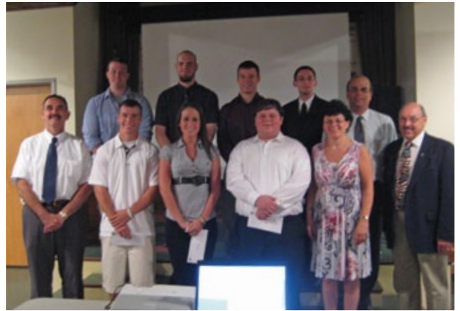
Scholarships are presented to students in Rhode Island and South/Central Massachusetts.

It has been said that, "The whole purpose of education is to turn mirrors into windows." Catholic Financial Life supports the education of our members by offering scholarships at all grade levels. But in addition to formal education, we also strive to enlighten our members through information sharing in a variety of ways. The Member Magazine, this newsletter, the monthly member e-newsletter, our Web site and Facebook page all contain information about our products, benefits, programs and initiatives. Members who prefer personal interaction may contact their advisor or the associates in our agencies or home office with any questions they may have. Education and information are yet another way that we, as a Catholic fraternal benefit society, strive to help our members and be of value to them.