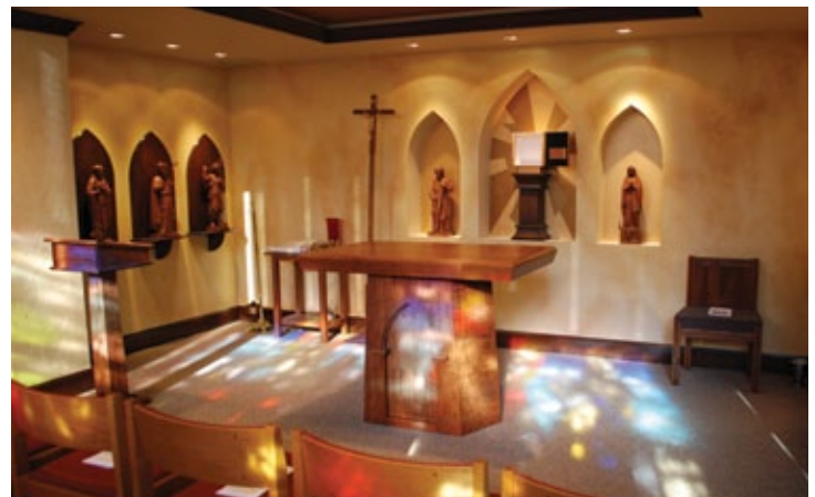
All Saints Chapel at the Catholic Financial Life Home Office.

We are believers in the power of prayer. Intentions are submitted to our online prayer network and are remembered in special Masses.