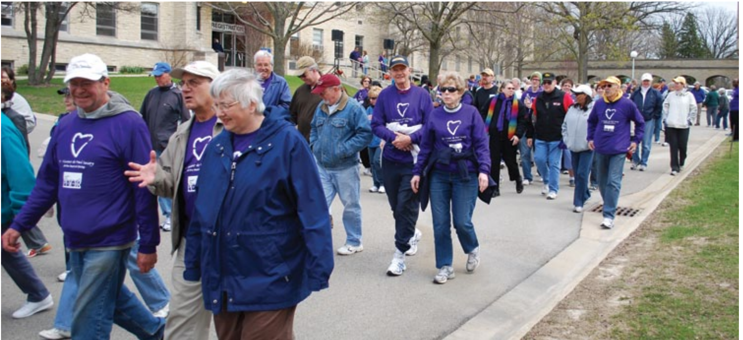
Participants at the recent Friends of the Poor Walk in Milwaukee.