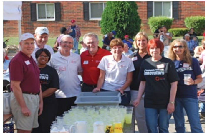
Volunteers from Catholic Financial Life are ready to serve beverages at the SVdP Block Party in Milwaukee.

The walk provides a great opportunity for families to get involved with your chapter and for youth to earn service hours towards a Catholic Financial Life scholarship. Form your chapter team today!