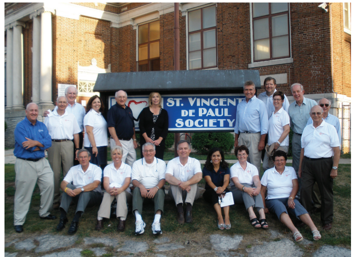
Catholic Financial Life's Board of Directors recently served meals to the homeless at a St. Vincent de Paul site in Milwaukee.

Just as this season of Advent teaches us all the importance of preparation, we also practice the virtue of patience as we await the arrival of our Lord. In a 2010 Advent reflection, Pope Benedict XVI compared this to the anticipation of a farmer waiting to harvest the fruits of his labors. The Holy Father said, "Patience and constancy are precisely the synthesis between human effort and trust in God." As we plan our events for 2012, let us place our efforts in the hands of the Lord and ask for His blessings.